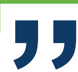
Figure 2. Feedback from paramedic students after completing placement at HRH.

"I felt really well supported while at my Clinical at HRH. The staff made every effort to provide learning opportunities for me... When we ran out of IV patients in Pre-Op, we headed down to Emergency, where the staff there were very welcoming and let me practice more IVs"