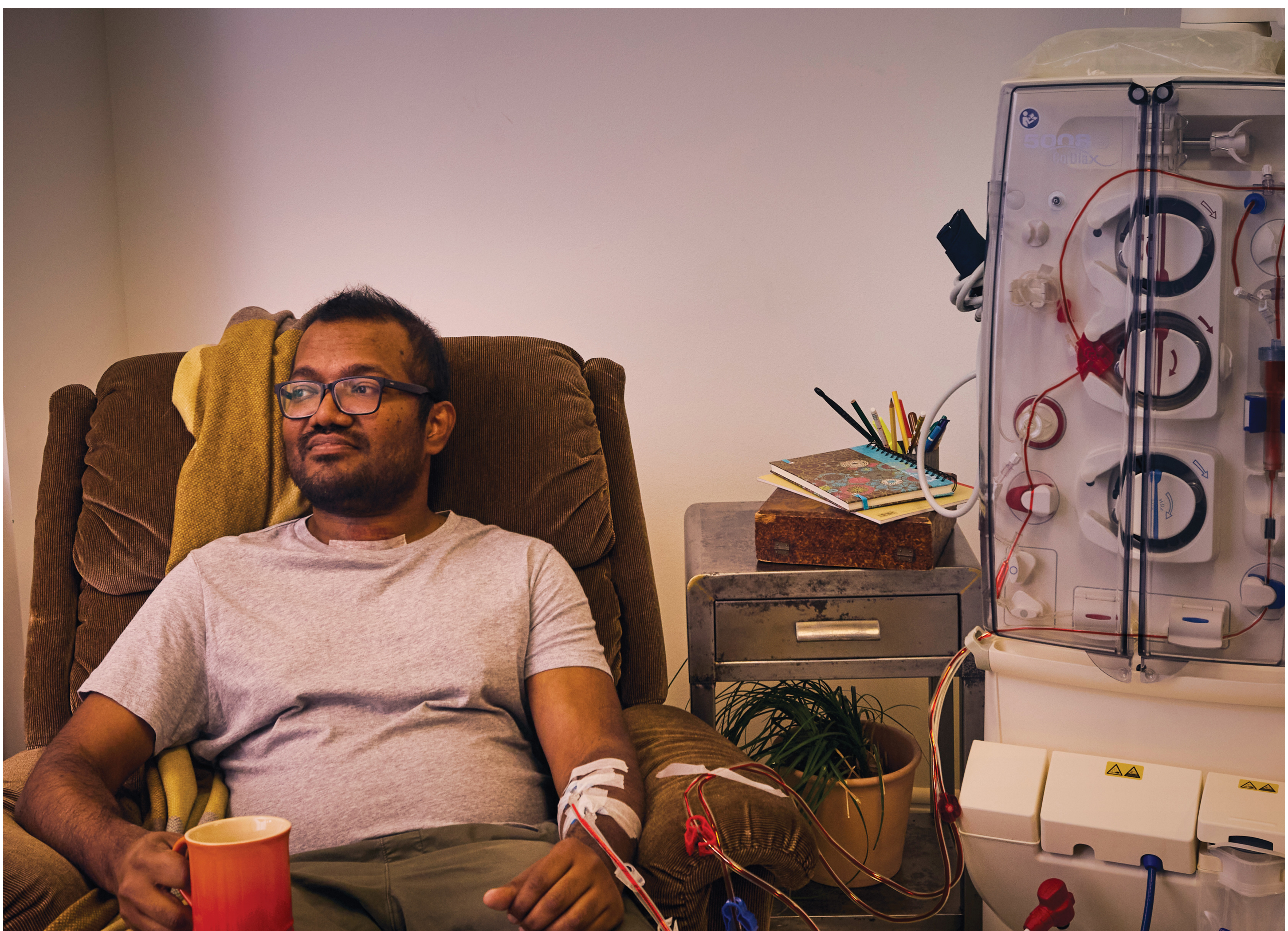
Figure 2. Picture of a patient receiving home hemodialysis.